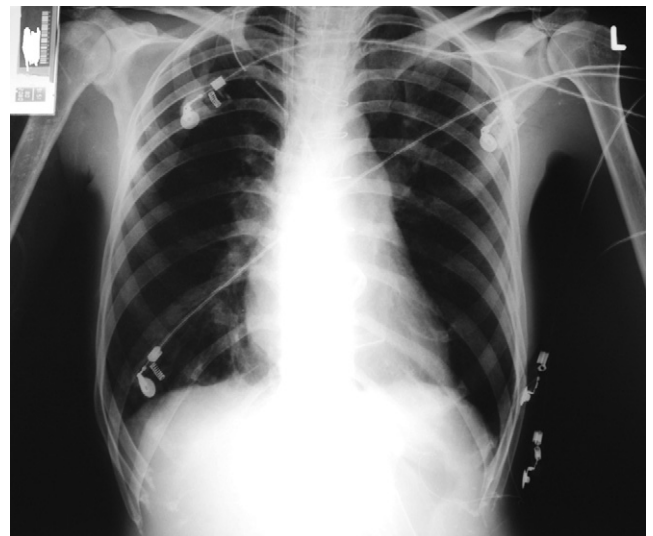
Fig. 2. Postoperative antero-posterior projection X-ray.