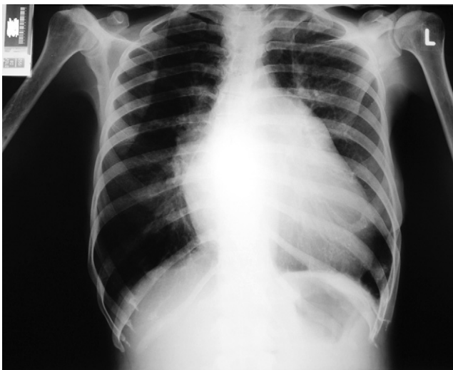
Fig. 1. Preoperative postero-anterior projection X-ray.

tricuspid suture annuloplasty and reduction atrioplasty was performed. Her first postoperative X-ray (Fig. 2) showed normal cardiac silhouette.