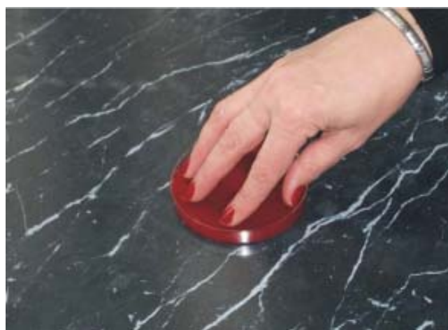
Figure 1: Touch method.

First, we put the swab in a solution with glucose and then we scoured it on the surface of the left hand, especially on the most critical areas which are the palmar creases, the inter digital spaces, the fingertips, and on the dorsal part of the hand. After that we put the