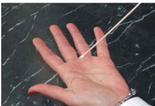
Figure 2: Taking sample with moist swab.

swab again in glucose solution and we took a few drops of the liquid and scoured it on a blood agar Petri dishes. For the right hand, we used the fingertips touch method, asking the HCW's to put their fingertips directly on the blood agar Petri dishes. Then, both the Petri dishes and test – tubes were incubated for 24 hours at 37° C. The day after, we carried out an identification based on the morphological aspect of the colonies and took samples from them for more specific biochemical tests, like the DNase and the methicillin resistance in Staphylococcus aureus colonies, or the IMViC test and the culture on UTI chromogenic agar, completing in this way the