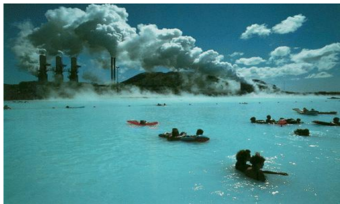
Figure 7.1. Geysers, Geothermal lakes - in Iceland