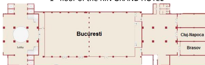
1 st floor of the RIN GRAND HOTEL

The acces to the outdoor parking and multifloor garage is on the right side of the building.