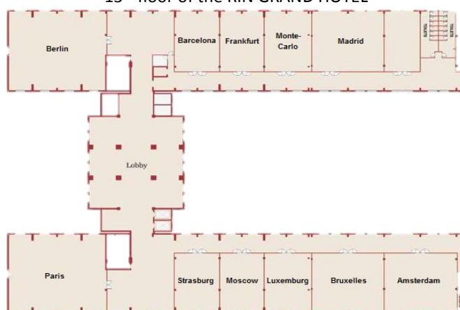
13 th floor of the RIN GRAND HOTEL

Rin Grand Hotel restaurants serve the most delicate of Romanian and international cuisine and guests can enjoy refreshing drinks and relax in one of the bars.