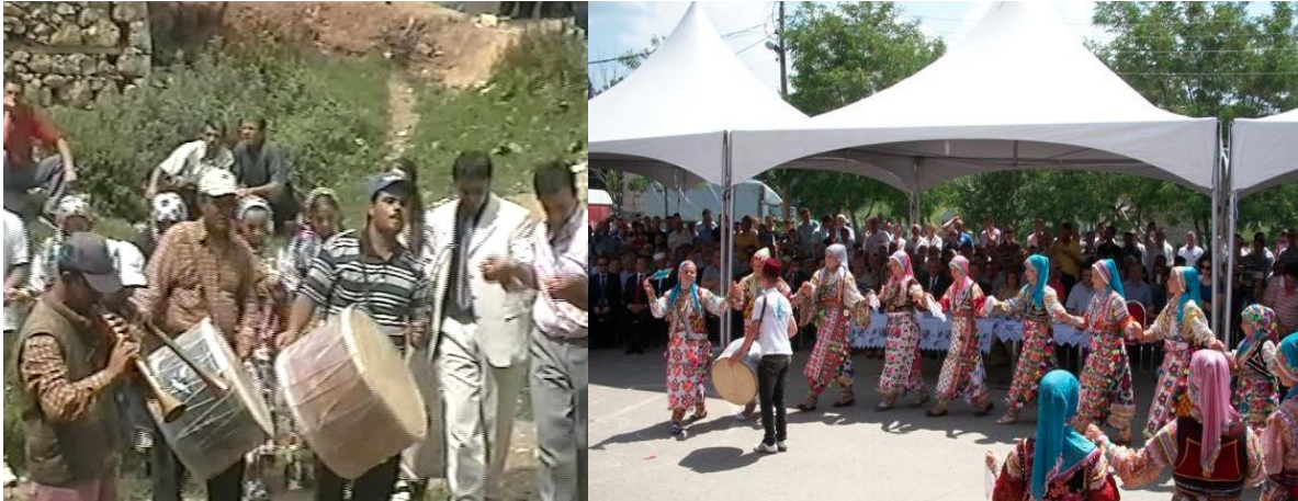
Photo 3: Traditional instrumental ansamble: zurnas and drums / Photo 4: CAS

Vocal–instrumental performances are present in musical activities of the CAS. Instruments such as saz , darabuka , daire , tablespoons , etc. are also used in their performances. The music repertoire of CAS consists of local autochthonous songs and Rumelian songs of the wider region.