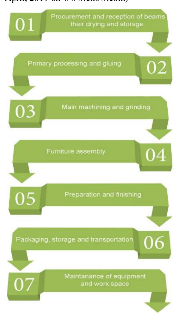
Figure 1. Operations that cover the process of producing wood furniture

The furniture manufacturing industry has been revolutionized over the past several decades. Today, most commercial and production furniture is created by large machinery, much of it automated and controlled by computer. The prevalence of high-tech machinery increases the accuracy and speed of manufacture, but also removes much of the craftsmanship involved. When used well, and with high-quality materials, machinescan make solid and attractive furniture. (Jagg Xaxx, Technology Used in Manufacturing Furniture, attached 27th of April, 2019 on www.ehow.com)