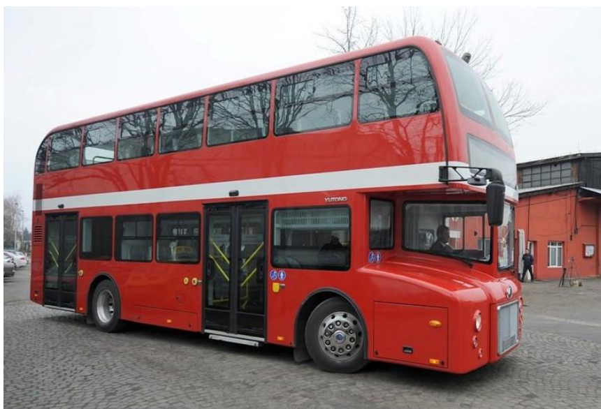
Figure 3. Two-deck city bus