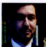
Trifon Totlis Greece