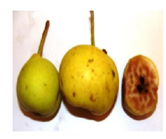
Fig. 5. Pear 'Letna kajkushka'