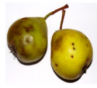
Fig. 2. Pear 'Evropsko avche'