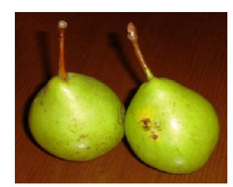
Fig. 6. Pear 'Vodenka'