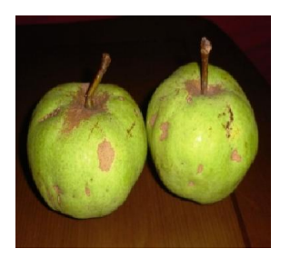
Fig. 7. Pear 'Trupnjak'