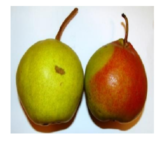
Fig. 8. Pear 'Tiranka'