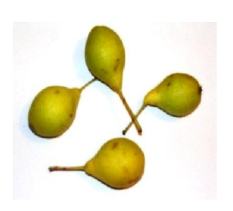
Fig. 1. Pear 'Carigradsko avche'