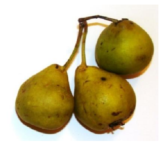
Fig. 3. Pear 'Sherbetka'