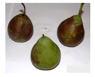
Fig. 4. Pear 'Sinec'