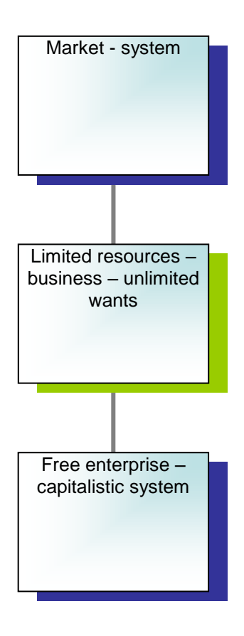
Figure 1. Economic system

Organizationally, this means that staff carrying out the work must be given the tools to enable the requirements to be met.