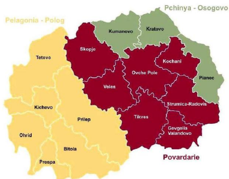
Figure 1. Wine regions in Macedonia

Each of these regions has its own vineyards that have a specific location and characteristics. There are 16 vineyards in Macedonia and 64 wineries in total. The annual production of wine is 78.5 million liters of flour and 28.05 million liters of bottled wine.