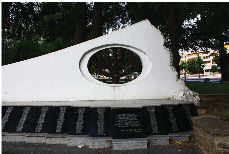
Figure 4. Monument of the deported Jews from Štip.

perceptions. To achieve these objectives, the study is based on a mixed research method incorporating qualitative and quantitative information obtain via interviews and secondary sources. A total of 18 interviews were held with a conversation time ranging from 20 to 120 minutes (Table 1). The interviews were conducted in June 2016 using the Macedonian language.