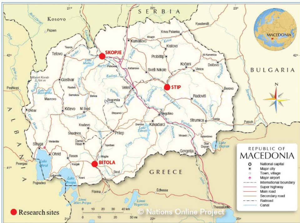
Figure 1. Research sites.

Skopje is the capital of Macedonia with a population of 544,086 inhabitants in 2015 (State Statistical Office of the Republic of Macedonia, 2017, p. 14). It is the economic and