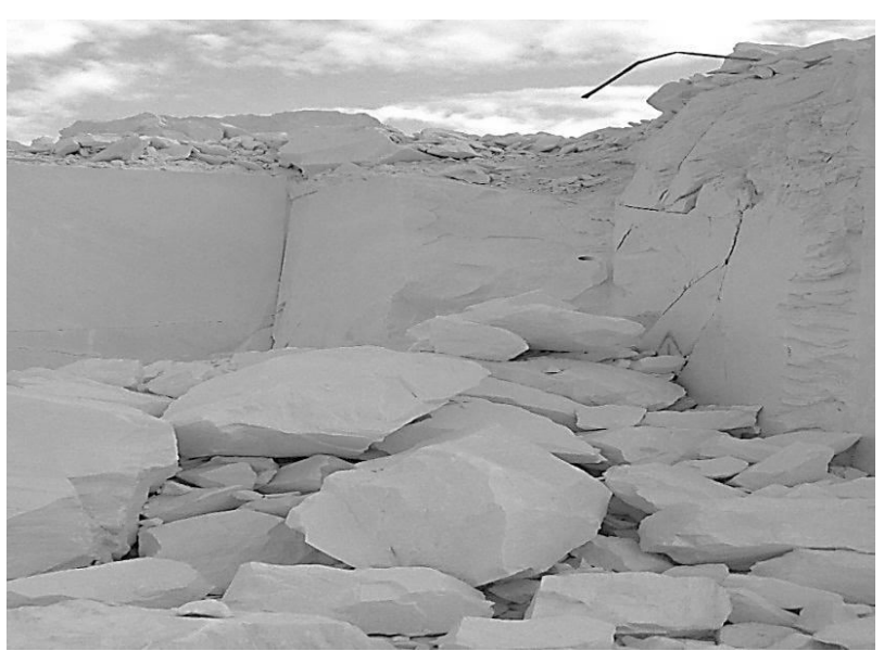
Figure 3. Blasting effects relative to granulometric composition

This practically means that within a radius of 15 meters this 28 kg in the blasting series, will have an impact on the surrounding massif in the form of tremors, minor deformations and significant values of the oscillation speed.