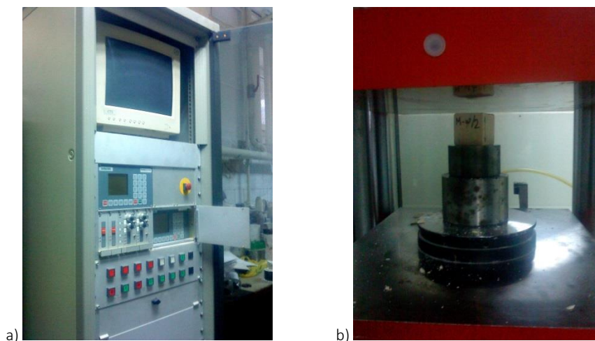
Figure 2: Experimental testing: a) machine for testing compression strength, b) specimen

The experimental testing of the compressive strength has been performed using testing machine type 102/3000 HK-4, with capacity of 3000 kN. The specimens were set in a way that the compressive force was applied perpendicular to the material layers. The compressive force was gradually increased by 0,5 MPa/sec, until failure of the specimen, when the force at failure F and respective stress were registered, Figure 2.