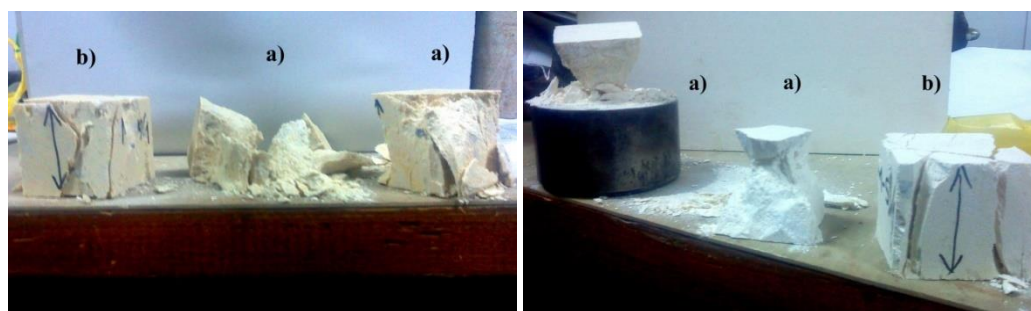
Figure 3: Type of failure in the tested specimens: a) failure in inclined planes, b) failure in planes parallel to the surfaces

Fracture in the remaining two samples occurs in vertical planes parallel to the sides and approximately parallel to the applied load, Figure 3b. This type of fracture is registered in samples M-S/1 and M-W/1. The influence of shear stresses in these two specimens was smaller and they may failed by lateral splitting. They exhibit much lower compressive strength than the first four samples, both for dry and saturated condition. The compressive strength for these two samples is lower about 60% than the compressive strength of the first four samples, Table 4 and Table 5.