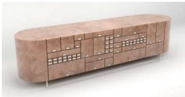
Fig. 1. Cabinet with advanced geometric pattern and use the golden section

Geometry - one of the oldest parts of mathematics that studies the spatial relationships and shapes of bodies. Geometry is one of the oldest sciences, which originated long ago before our era. Translated from the Greek word "geometry" means "surveying" ("geo" - on - Greek side, "metreo" - measures). Despite the apparent geometry and design as decorative art related concepts it seems they are sometimes excluded and are completely different from one another, one idea (geometry) is a branch of mathematics, ie of science, and one idea (design) expression of human creativity and sensitivity, and indeed at other times there is a connection between them. The ultimate result of implementation in the geometry is perceived in different patterns and shapes of furniture, inspired by basic geometric shapes, triangle, square, rectangle, hexagon, round and others. With their combination and development in complex geometric patterns created forms of furniture that impressive work in the interior.