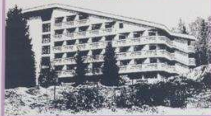
УОГС "Георги Ст. Аврамов" - Юндола

"Устойчивият свят, както и неговите природни и обществени структури, не е състояние, което веднъж завинаги трябва да бъде установено. То не е и идеален образ, с който действителността е длъжна да се съобразява. Такиво устойчиво развитие е форма на движение, което премахва сегашното състояние. Условията, темповете и посоката на това движение са предопределени от съществуващите предпоставки. Задачата за науката за устойчивото развитие е да ги ренири, а на практиката да ги използва при вземане на управленски решения."