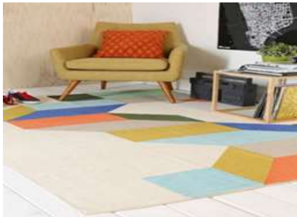
Fig. 7. Zig-zag lines geometric shape as decor carpet

very soft retro note but in any case it season space with an interesting rhythm of different shapes, though clear and simple, are intriguing and attractive.