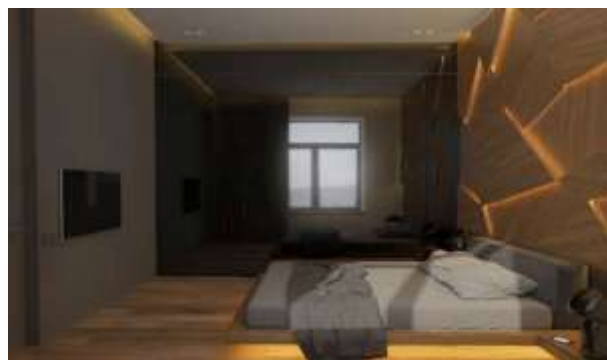
Fig. 6. bedroom wall made of irregular geometric shapes and bed into rectangles

Those living further consideration are covered with furniture inspired by different geometric forms. The decorated objects with geometric shapes seem timeless and perfectly fit into modern interiors. These elements can be chairs, shelves, chairs, cabinets or textile products such as curtains, rugs, bellows and others.