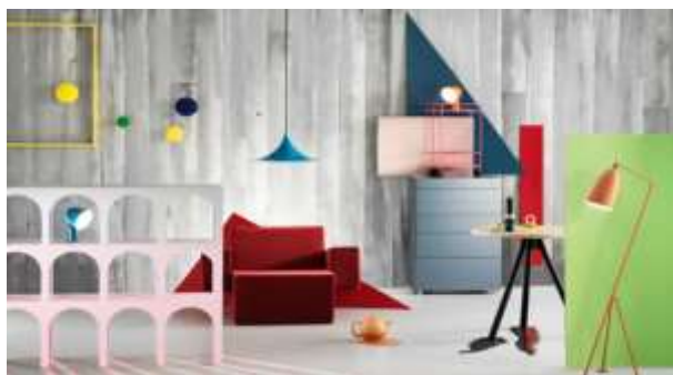
Fig. 3. Interior elements with different geometric shapes