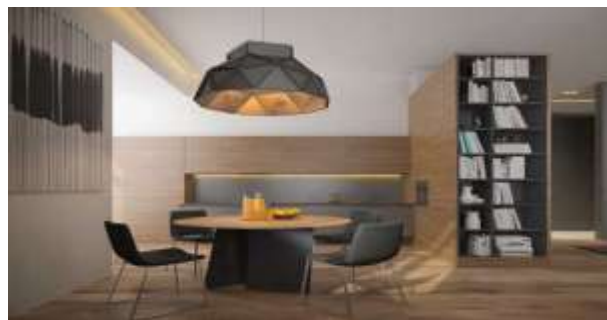
Fig. 5. Interior rectangular table and a hexagonal shape

In the bedroom, the wall above the bed is treated with playful wooden surfaces as geometric irregular shapes.