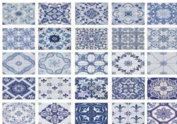
Fig. 2. Geometric elements used in the creations of floor tiles

furniture, ceramics, processing of metals and others. The decorative fabrics are filled with different geometric patterns of the simplest creations to illusory effects. Leave a strong impression and various geometrical shapes introduced in ceramic tiles for floors and walls.