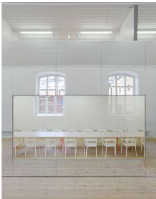
Figure 6. Mirrors illusion