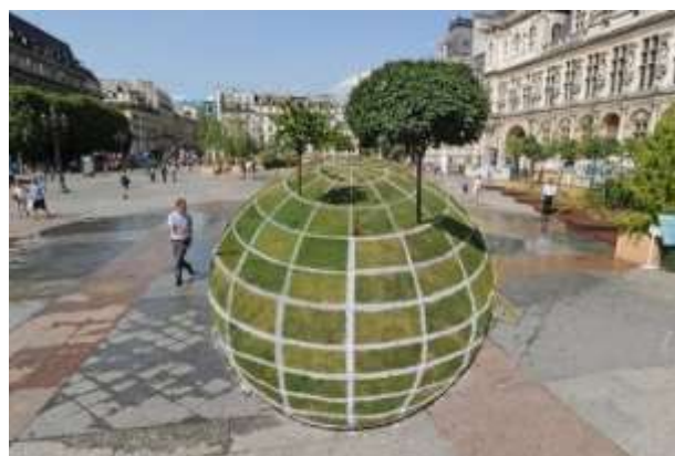
Figure 3. Optical Illusion exterior

Things that can define it interior space is primarily the color key elements in the interior, as well as the placement of illumination and daylight of space.