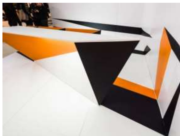
Figure 2. Optical illusion interior

Typically, this method can expand the space, but it certainly does not meet any space because it is impossible to say internal volume does not allow it. However, despite the physical method for changing the range of the interior, there are some design decisions that can be changed with the visual perception of space. They can spread walls without destroying, ie with the help of optical illusion.