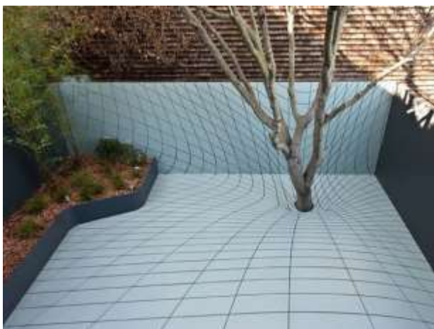
Figure 4. Illusion in exterior

Red and all shades of red effectively emphasize horizontal lines and flat-bottomed.