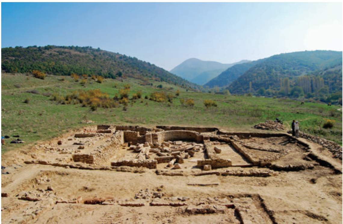
Early Christian city basilica

The Early Christian city basilica, measuring 16.80 m in length and 13.45 m in width, diverts from the standard form of basilicas and represents a shortened type of an Early Christian basilica construction of a nearly square shape. Due to this shape, the ratio of the internal and external dimensions is approximately 1:1 (length and width). On the territory of Macedonia, basilicas of