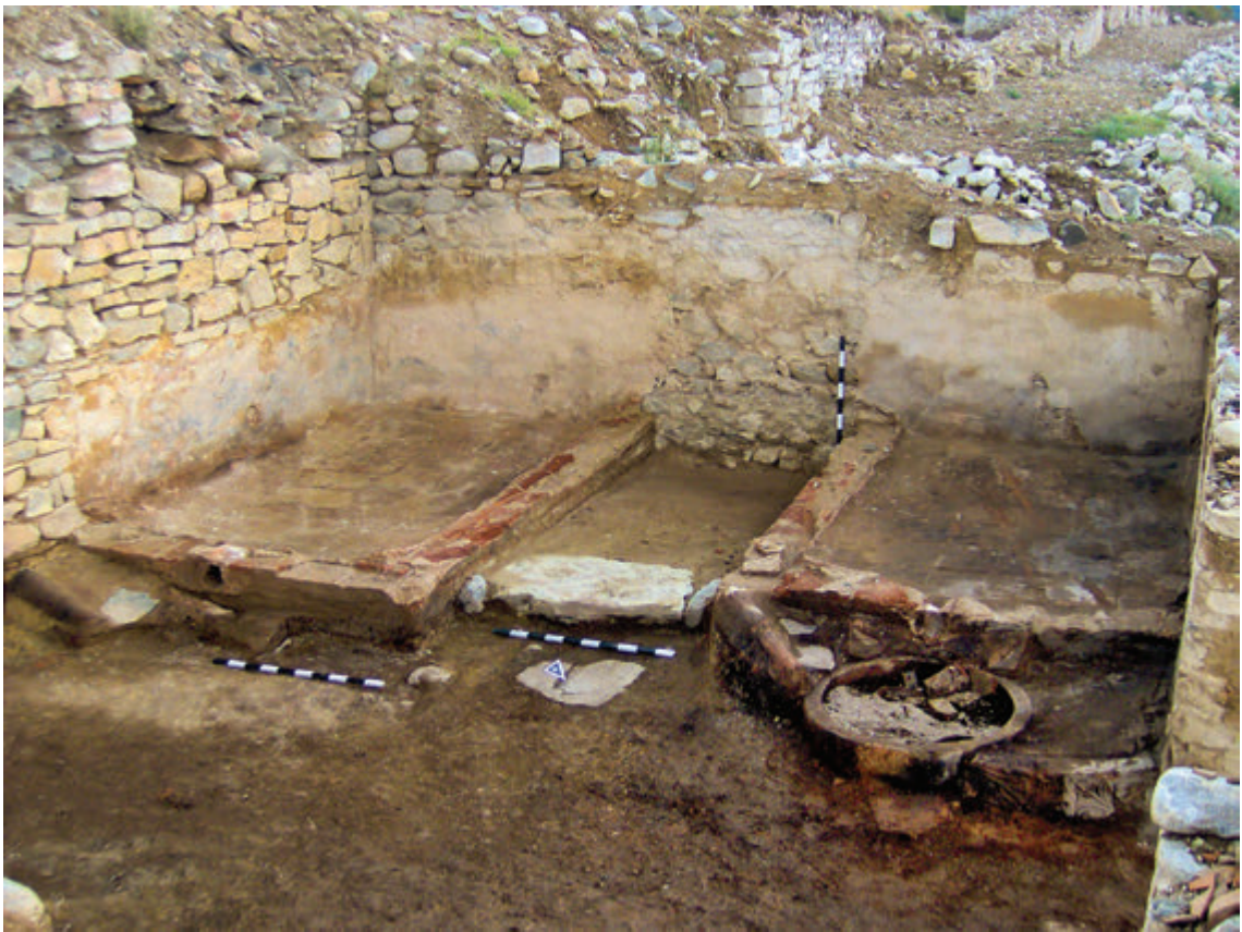
Episcopal residence, north-eastern residential wing