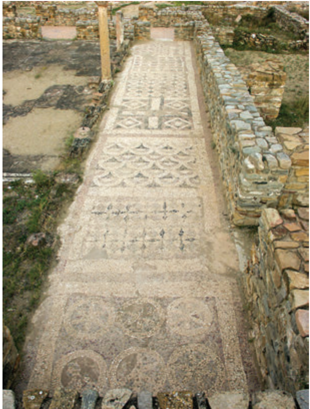
The episcopal basilica, northern nave

The apse was a step higher compared to the presbytery. A large earthenware vessel used in the consecration of the church, containing the holy remains of the martyr, was discovered there.