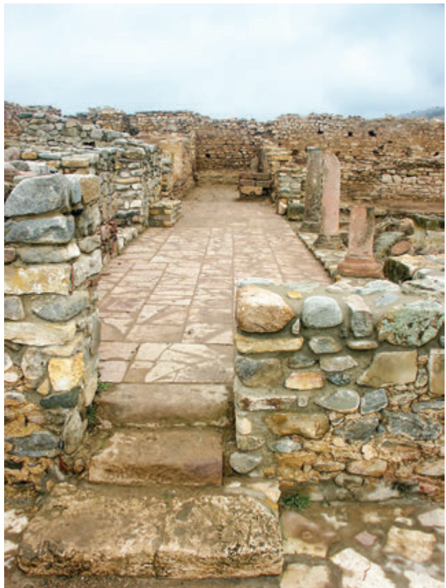
Episcopal residence, north-western residential wing

The porch has three entrances: north-western, with a width of 1.10 m, by means of which it is connected with the main hall and the street by the north-