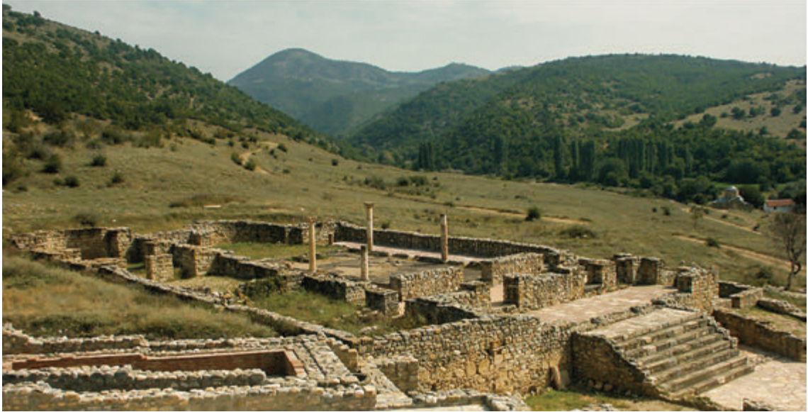
The episcopal basilica

It is situated on a dominant position superior in its size and significance compared to other buildings in Episcopium. The episcopal basilica is 40 m long and 20 m wide, and represents a standard type of an Early Christian church building, widespread throughout the Mediterranean countries and the Balkans.