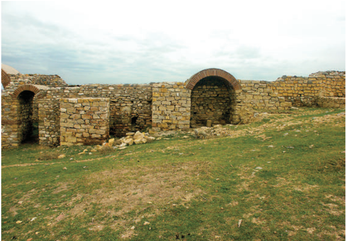
Niches and stone stairs leading up to the third floor of the towers of the gate Principalis

The niches flanked by the inner facade of the fortification were primarily built for the stone stairs leading up to the platform of the curtain wall. The secondary function of the niches was their use as a shelter for the guard and for weapon storage. They also have a decorative element which