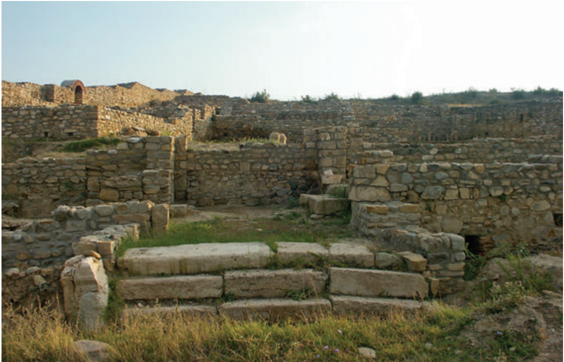
The monumental entryway of the Episcopium