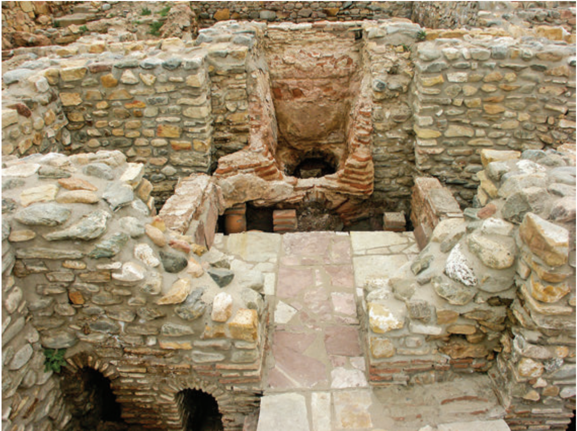
Large thermae, caldarium

Room no. 2, tepidarium , or a bath with lukewarm water – it was rectangular, with a northeast-southwest orientation, 5.40 m long and 2 m wide, with an expanded apse section, 1.80 m to the northwest.