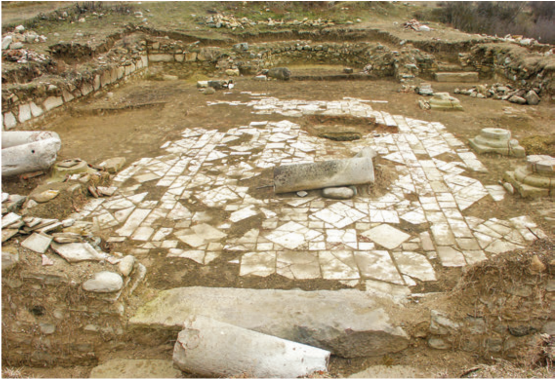
Basilica Extra Muros

The floor of the basilica was luxurious, executed in opus sectile , and during research, rich architectural stone plastic was also discovered.