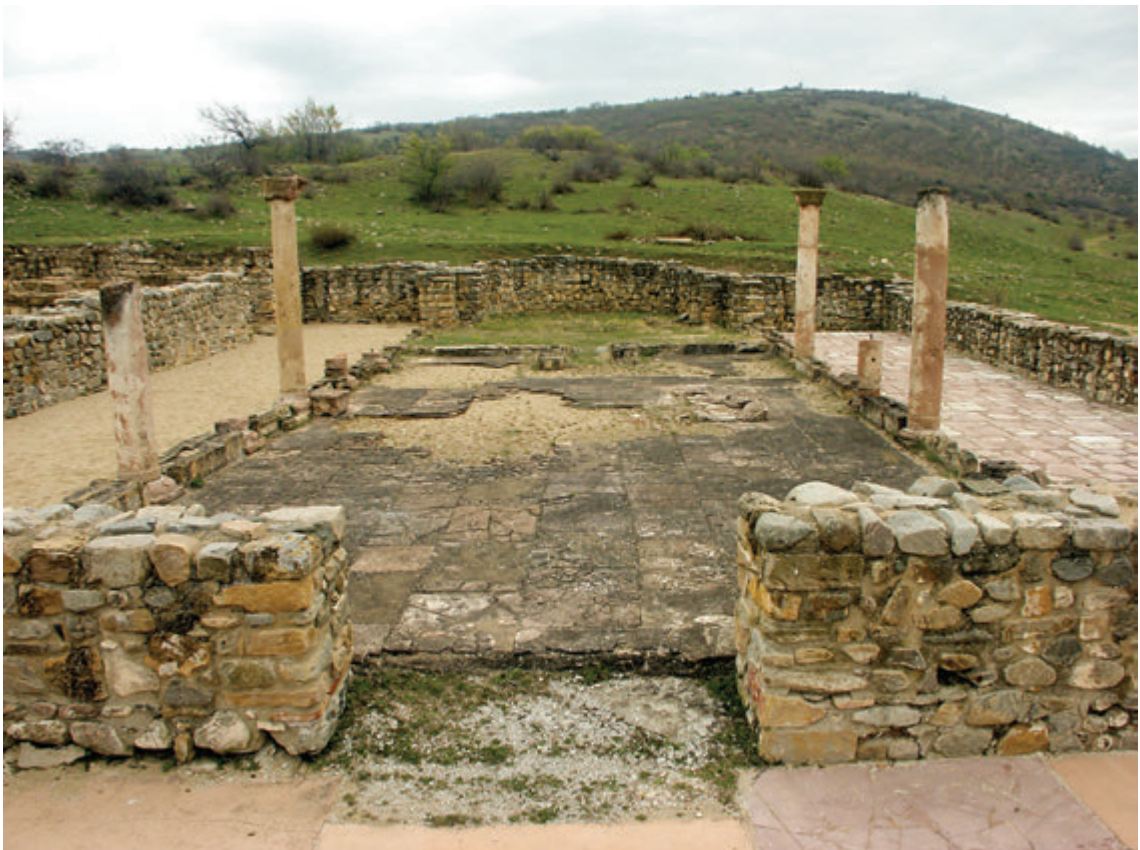
The episcopal basilica, central nave