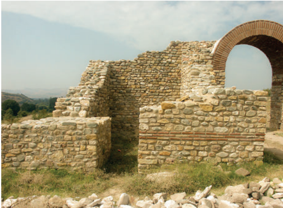
Tower 3 and part of a gate

One of the most important fortification elements built for the purpose of defending the city were the towers which protected the Main gate and the curtain walls (the space between two towers) .