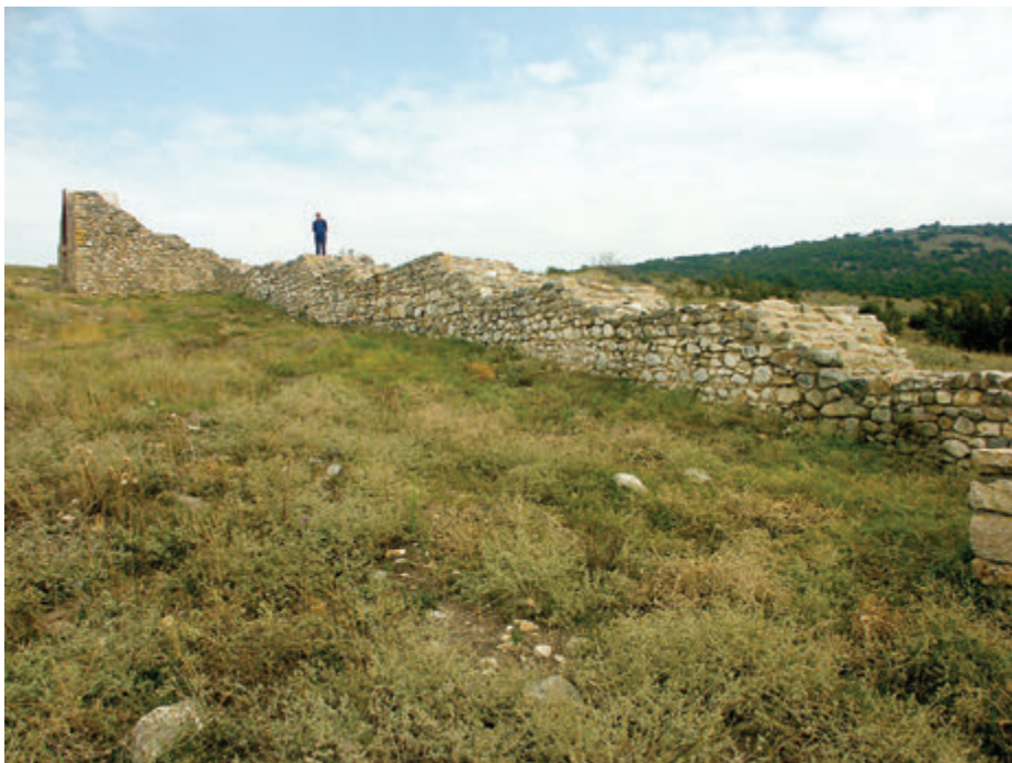
Curtain wall C (the space between Tower 3 and Tower 4)