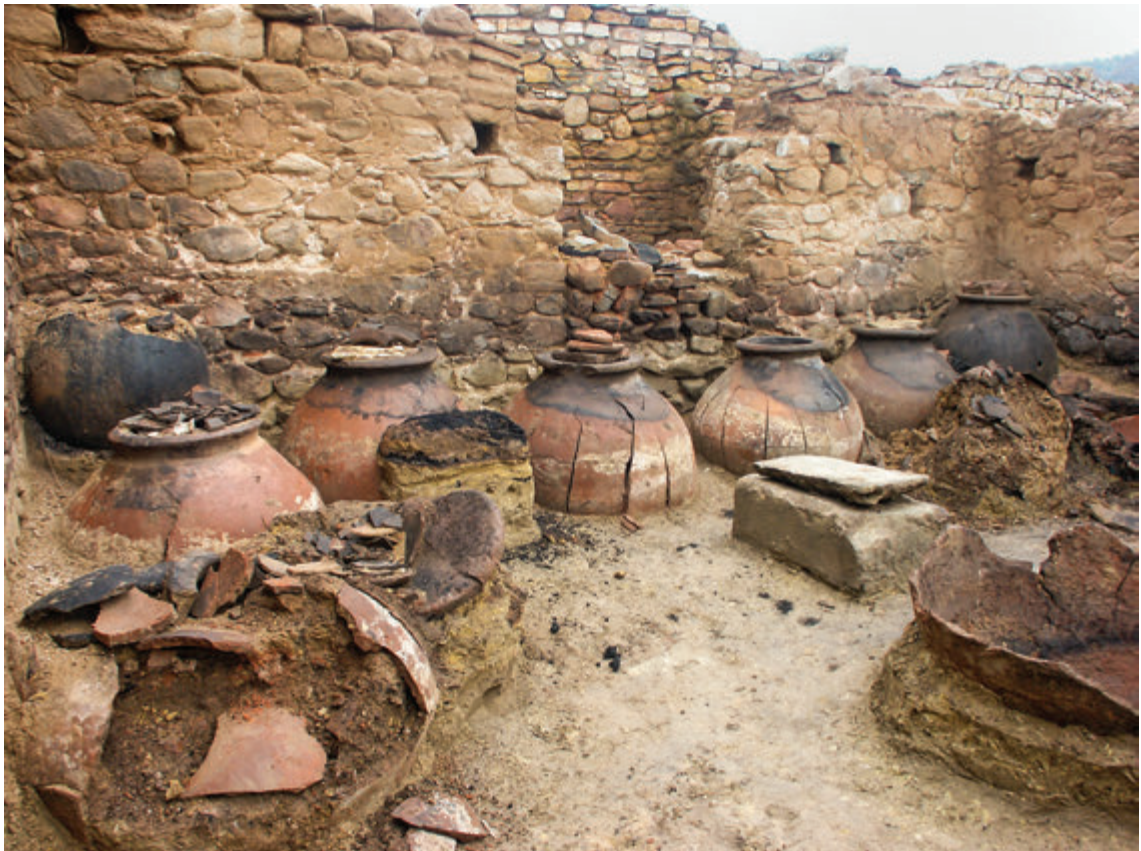
Episcopal residence, horreum

As a result of the frequent Avar-Slavic attacks in the middle of the 6 th century, a need to repurpose part of the space of the residential section in the Episcopal residence complex arose. The fourth room of the north-western wing was converted into an area for food storage (horreum) , where 16 pithoi, arranged in rows, were discovered. The most significant repurpose of an area of the