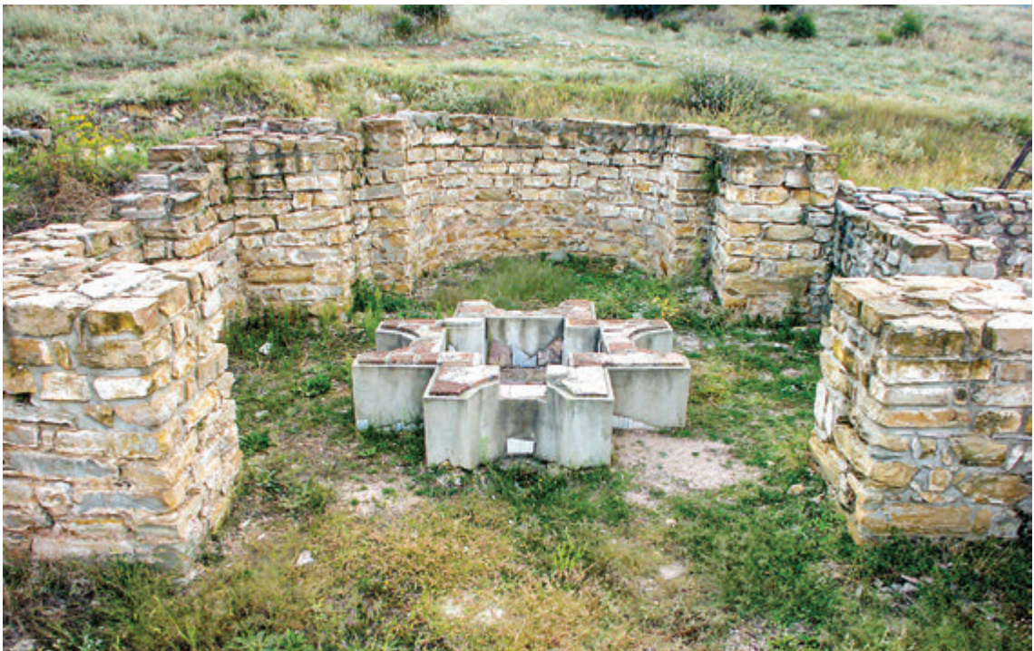
Baptistry, 6 th century