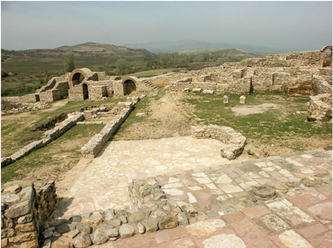
The square of the Episcopium

The square is divided into two parts by a wall and is oriented in a west-east direction, with an entrance 1.30 m wide serving as a connection to the Episcopal residence and the Cistern.