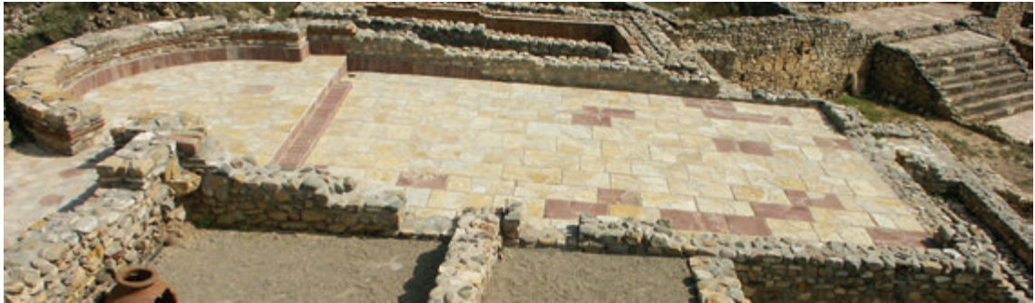
Episcopal residence, main hall

The main hall was rectangular, with a northeast-southwest orientation, and a length of 22 m and a width of 7.80 m. This space was composed of four sections placed on different height levels: an apse area, a rectangular reception room, a commercial area consisting of two rooms, and a porch. The floors in the hall and the rectangular apse area were paved by means of red rectangular processed stone tiles laid in parallel rows along the hall.