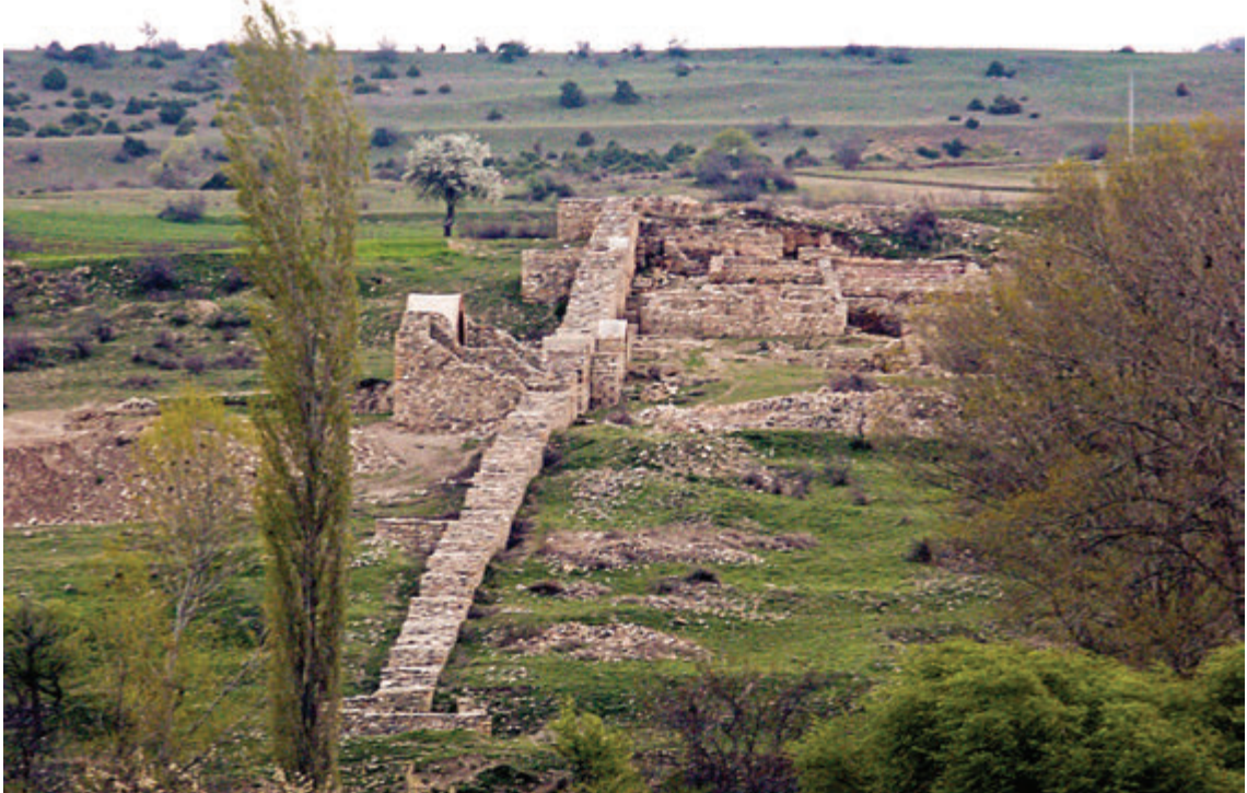
Northern defensive wall

By means of archaeological excavations, the following fortification sections were discovered: the north-western defensive wall with the corner towers and the main gate - Porta Principalis ), the north-eastern defensive wall with the north-eastern gate, which connects the city with the suburbium, as well as small parts of the south-eastern and south-western defensive walls. Based on the preserved stairs near the niches I and II, it is assumed that the height of the fortification ranged from 12 m to 12.50 m.