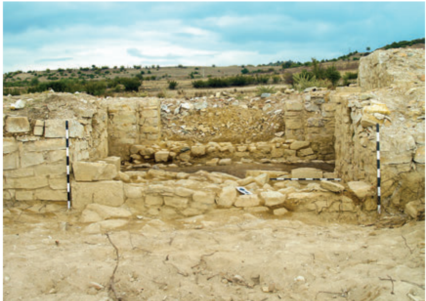
Main gate – Principalis

Previous research of Bargala has resulted in the discovery of two gates: Porta Principalis , located in the central part of the north-western defensive wall, and the north-eastern gate , built to connect the city with the suburbium. Characteristic of both gates is that in both of them was detected an external propugnaculum - an architectural solution intended to increase the city's defence. Architectural solutions of this type were very rare in the construction of gates in Late Antique cities. In Macedonia, a propugnaculum has not been discovered yet in the ancient cities of Stobi, Heraclea, Scupi or Styberra. They were also, generally, rarely found in the Balkans. So far, one has been discovered in northern Bulgaria.