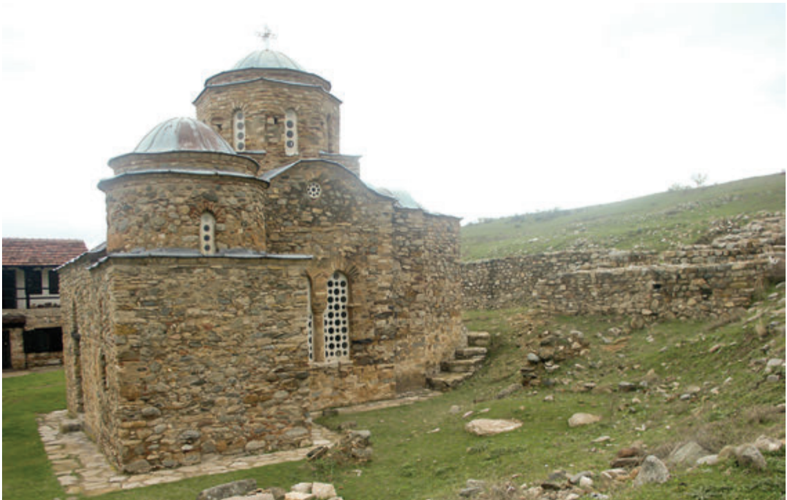
Church of Sv. Gjorgji (St. George)