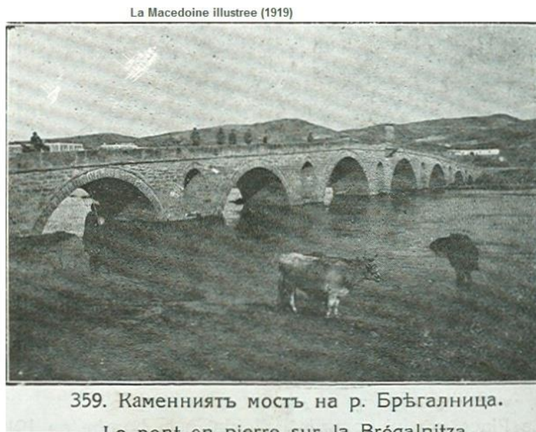
Fig.5 Emir Kjachuk Sultan Bridge in 1919.

was several times renovated. It's 30 to 40 meters long and 6 to 8 meters wide. Enclosed with a metal fence, but unfortunately it has never been adequately lit or protected which would regained its lost splendor and value it has now, and even in the past. It is certain that it was thoroughfare during the Turkish occupation, in conquering the other nations by the Ottomans, and through it a number of famous historical figures had passed. The importance is reflected in the fact that Bregalnitsa was considered a large river and needed bridging in this section. This bridge was the first one with such an architectural form and the uniqueness is evident in the fact that in the eastern part of the state no such similar bridge exists. During the First Balkan War, through this bridge went the demarcation line, which divided the city into a Serbian and Bulgarian part. The settlements on the left side of the river Bregalnitsa were under Bulgarian rule, while those on the right came under Serbian occupation. Bridging the river is done through eight shafts, shaped with carved stone blocks with appropriate architectural proportions of which today are visible only six (Fig.6).