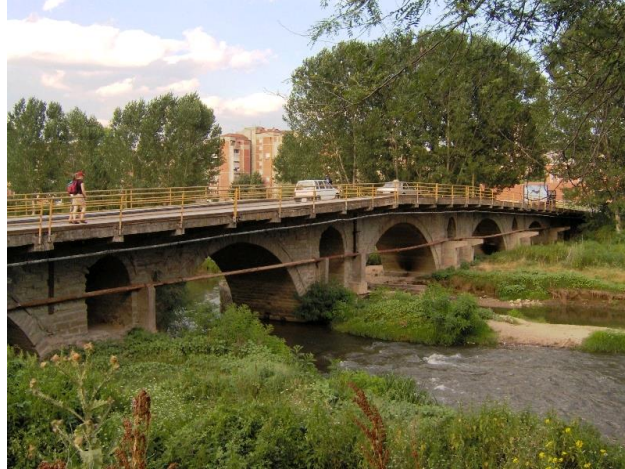
Fig.5 Emir Kjachuk Sultan Bridge (today)

"Many drinking fountains and basins supplied the neighborhoods with water in Macedonia", 20 even in Shtip. These fountains which served to "supply the population with drinking water, typically located in neighborhood centers, were built by skilled workmen called fountain makers, then the basins - mostly built in the courtyards of mosques associated with performing the religious ritual - abdest". 21 In the past, there were several drinking fountains in Shtip, located in different neighborhoods ...although small in dimensions, they were very vividly integrated in the space and were present in every neighborhood - neighborhood drinking fountains.