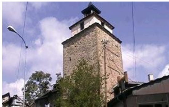
Fig.4 The Clock Tower

give up, once said that she will do it, but he in return will give the city, as a token, for example, a tower that will be the city's clock. Anka thought that the bey will give up on her love. However, the Turk, being head over hills in love with the beautiful Anka, in quite a short time built the tower and took the young citizen of Shtip away", says the legend about the Clock Tower in Shtip. The object had an embrasure and a balcony. The Institute for Protection of Cultural Monuments and the museum of Shtip, point out that in one month the conservation, restoration and reconstruction of the clock tower will begin, a monument of the culture from the 17th century, which is under state protection. The rare monument in the city center will get its authentic look. The tower is planned to have three large clocks which citizens can use to tell the time. The construction works will be performed thanks to the donation of a private businessman from Shtip.