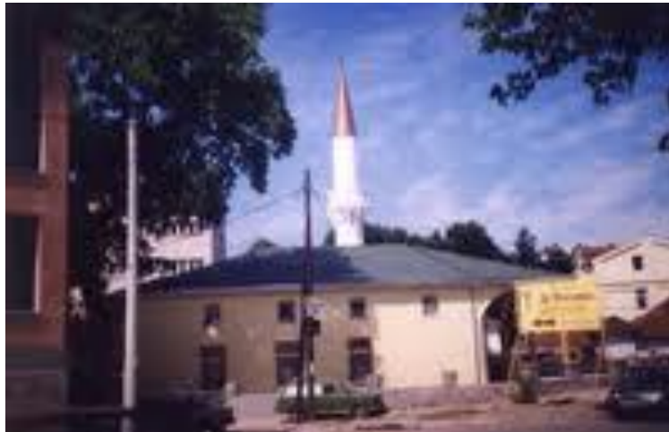
Fig.2 Kadin Ana mosque

Another mosque which still exists in the area of Shtip is the Kadin Ana mosque , located in the city center, near the National Theatre. It is of recent date and is thought to have been built in the second half of the 19 th century. Since then it has often been restored, so it has lost its original shape. This mosque still has not lost its function. It has its own hamam and is visited by the Muslim population of the city and the surrounding area (Fig. 2).