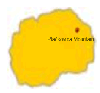
Fig. 1: Pla..kovica Mountain as sampling area in R. Macedonia