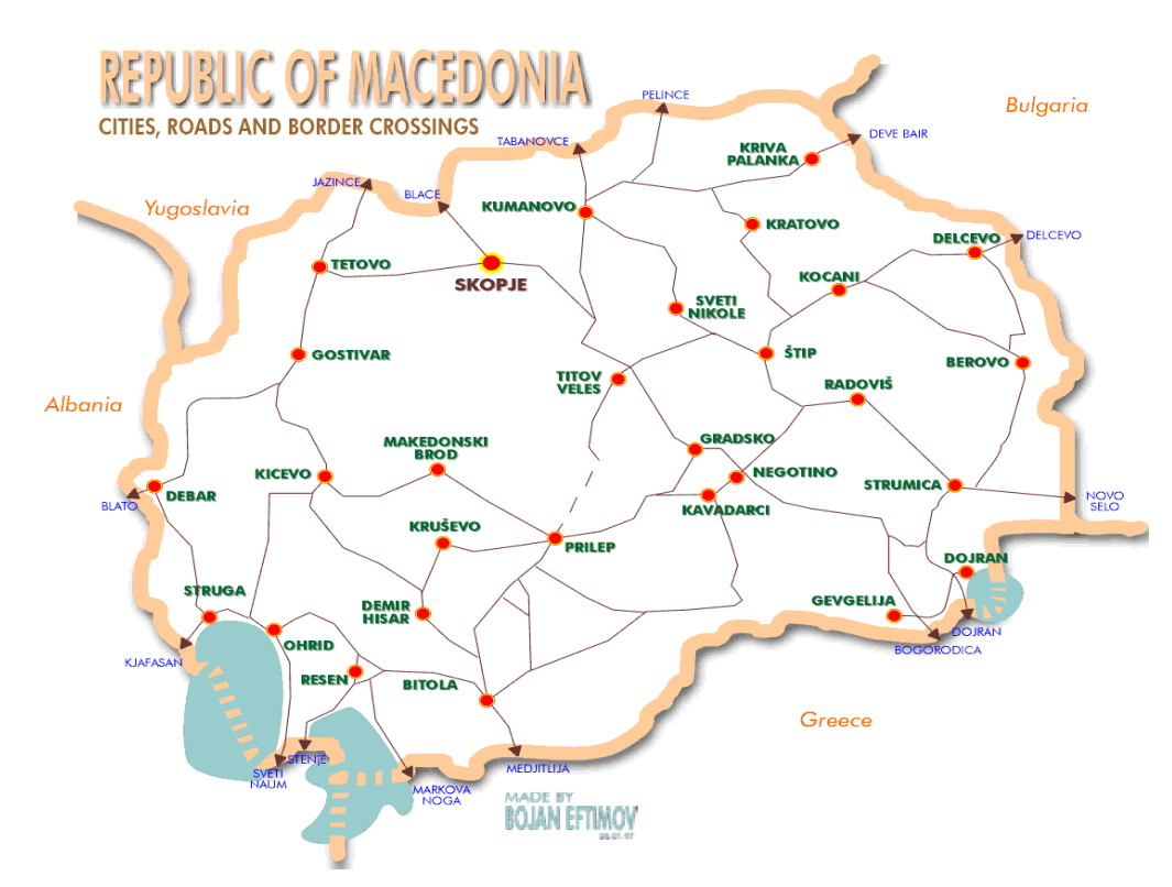
Figure 2. Map showing sampling points on the whole territory of the Republic of Macedonia