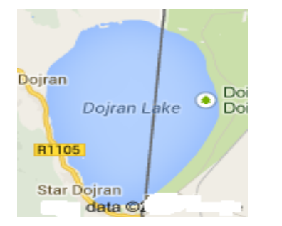
Figure 3. Map showing sampling points in Dojran municipality