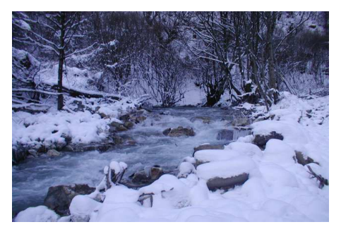
Figure 5. Apperance of Studenchica River at an altidude of 965 m