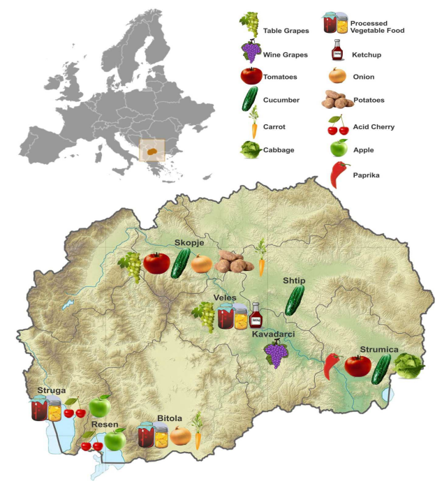
Figure 1. Regions of food sampling

The national pesticide monitoring was performed according to a nation-wide sampling plan designed by the Macedonian Food Agency. The plan was based on data concerning dietary consumption and production of fruits and